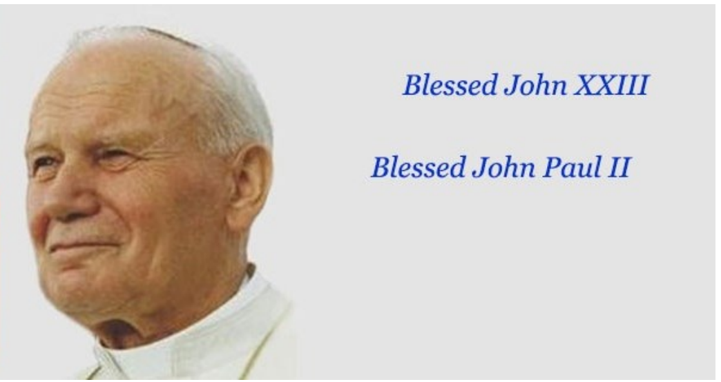
Blessed John XXIII